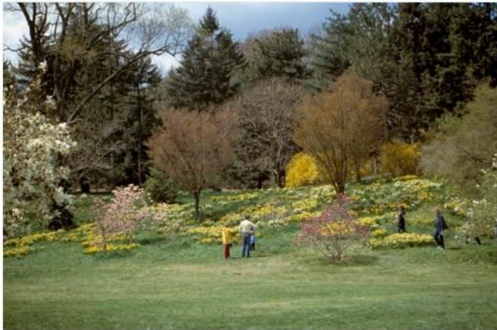
Daffodil bank near Visitors Center, Click to see more