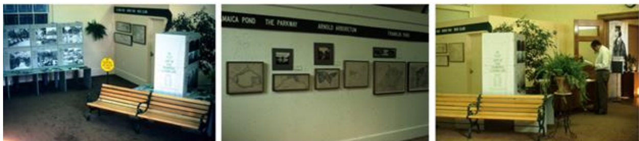
Images of the exhibition Art of the Olmsted Landscape: His Work in New York City