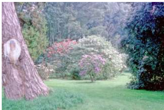
Azaleas at Richard Warren Pinetum 5/13/1980

273 slides taken between 9/1975-8/1986. The collection is primarily of coniferous trees and is arranged alphabetically by plant name, and then chronologically by date. There are also images of the Arnold Arboretum, the Pinetum, trees in the surrounding area, and slides from trips taken to California and England. Table of slides below.