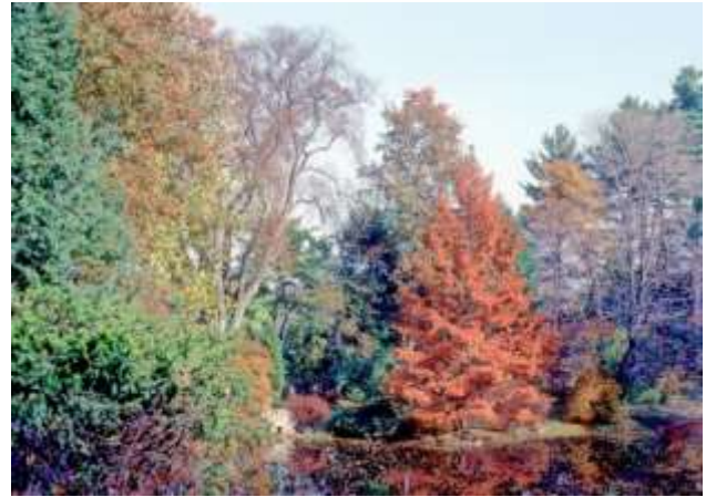
Metasequoia, Richard Warren Pinetum, 10/30/1982