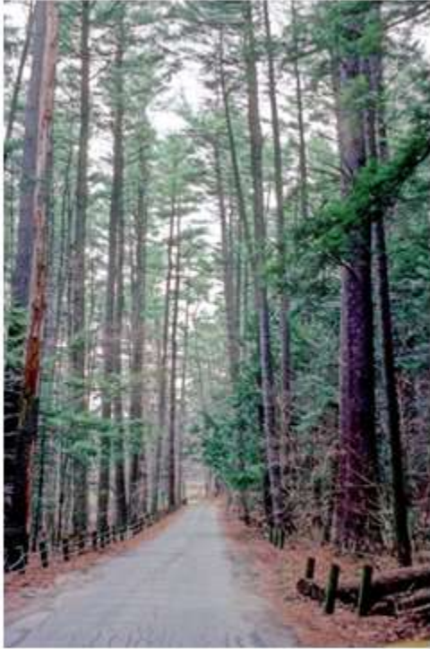
Cathedral Pines, Cornwall, Connecticut, 4/12/1980