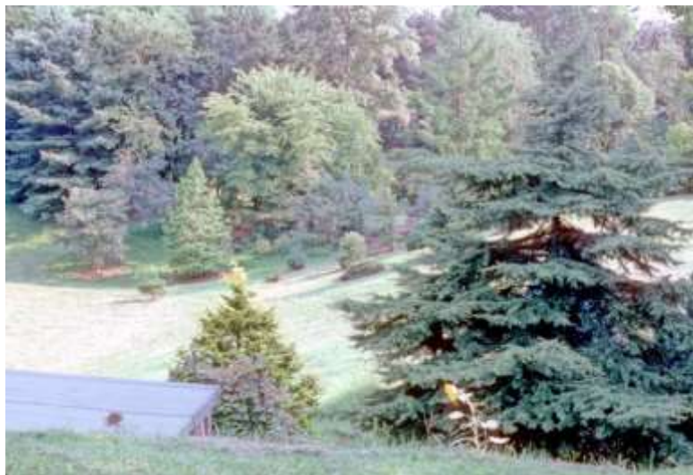
View of Richard Warren Pinetum, n.d.