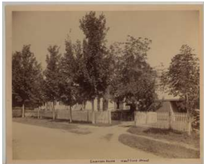
41 Westford St, Chelmsford