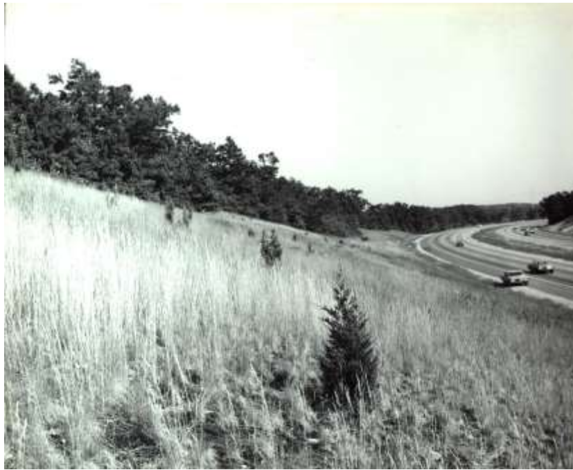
April-June 1975 Cover of Trees Magazine , Fordham Cover picture.