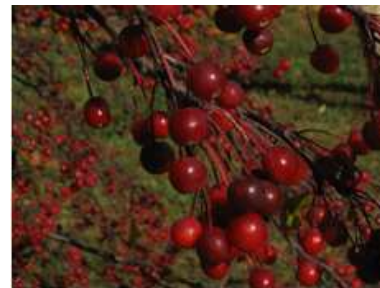
Malus 'Donald Wyman' 23254*A