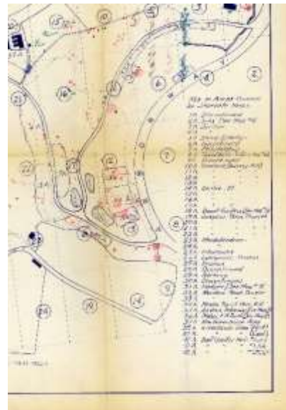
Image 4 and 5: Sections from maps included in Planting Lists from Fall 1968 and Spring 1969