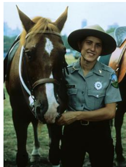
Mounted Park Ranger, unidentified, undated, photographer unknown

Subseries VII: Budget and Expenses: Budgets, invoices, brochures, warranties and related notes