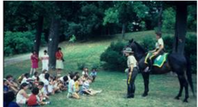
Mounted Park Rangers at the Arnold Arboretum, undated