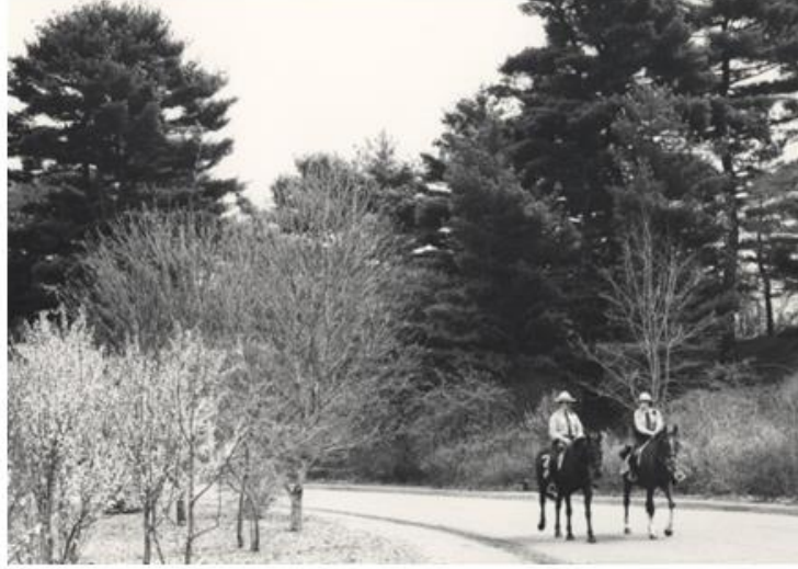
Boston Mounted Park Rangers patrolling the Arboretum, ForestHills Road, 1991