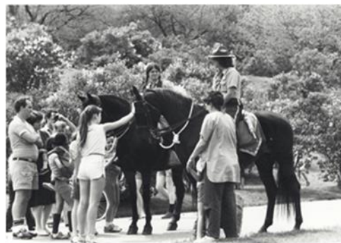
Mounted Park Rangers at the Arboretum 1983

The Boston Park Rangers program was based on the urban ranger program in New York City and operated seasonally from 1982 until 1988. During the first year, Boston Park Rangers patrolled the Boston Common, the Public Garden, the Commonwealth Avenue Mall, and the Arnold Arboretum. That first year the Boston Park Ranger Mounted Unit, which was established through a coordinated effort with the Boston Police Department and the Boston Parks and Recreation Department, patrolled the Arboretum on horseback. In the following years the Ranger program was expanded to include Franklin Park, Jamaica Pond and the Back Bay Fens.