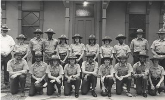
Boston Park Rangers 1983

The late 1970s and early 1980s saw an upswing in violence and vandalism in Boston, which led to a subsequent drop-off in visitation to city parks. Responding to the growing concern for Boston's parklands, in 1982, under the aegis and management of the Boston Parks and Recreation Department, the Massachusetts Association for Olmsted Parks, The National Association for Olmsted Parks, Friends of the Public Garden