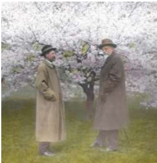
Charles S. Sargent and Ernest H. Wilson standing in front of a Higan Cherry tree ( Prunus subhirtella), 1915.

Charles Sprague Sargent (1841-1927) was the first director of the Arnold Arboretum, and served the institution for over 54 years. Born to a prominent Boston merchant family, his unique vision, horticultural knowledge, publications, commitment to education, and tenacity led to the creation of the first public arboretum in North America, along with its library, herbarium, and prominence in the history of Boston. As the penultimate link in The Emerald Necklace, a network of public parkland designed by Frederick Law Olmsted, the Arnold Arboretum continues through the seasons as a living testament to the Sargent legacy.