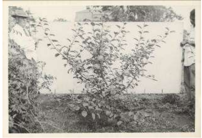
Photographs of dwarfing experiments. McIntosh/ Malus sargentii 'Rosea'/ Malus sikkimensis knotted cross at 4 years (right). 1950s