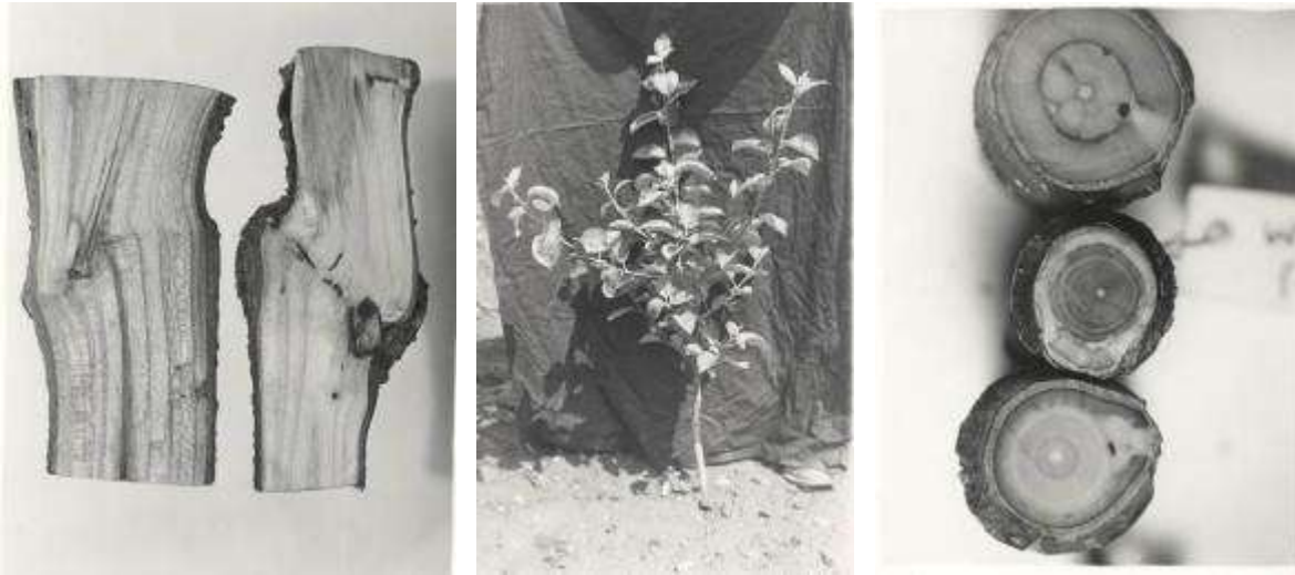
Photographs of dwarfing experiments from Box 15, Envelope 2. Unlabeled, undated. 1950s