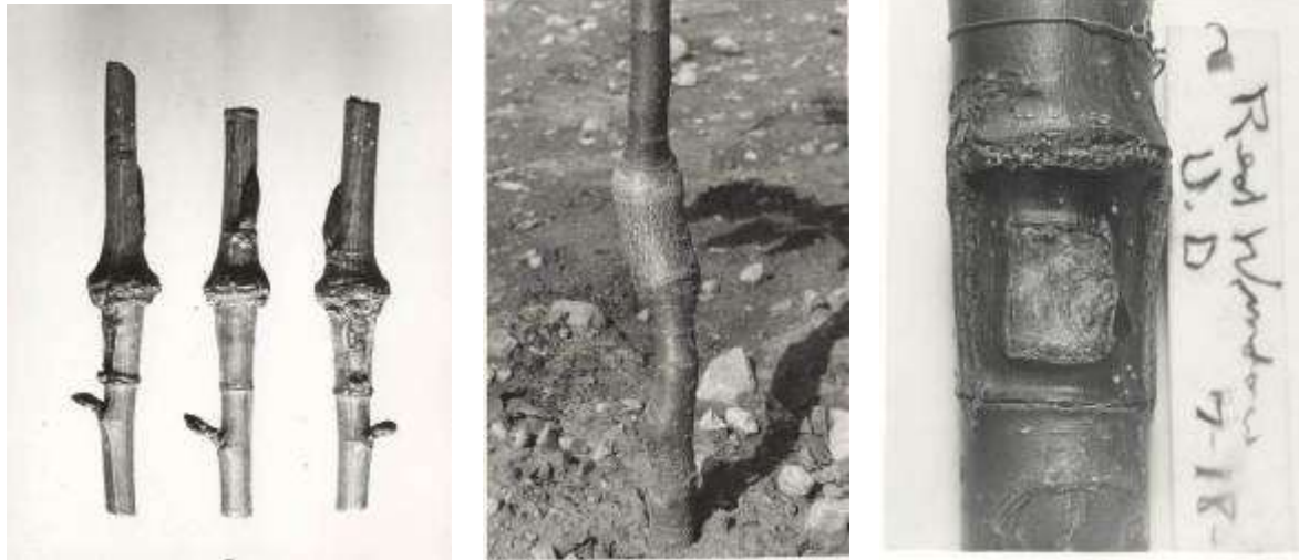
Photographs of dwarfing experiments from Box 15, Envelope 2. Unlabeled, undated. 1950s