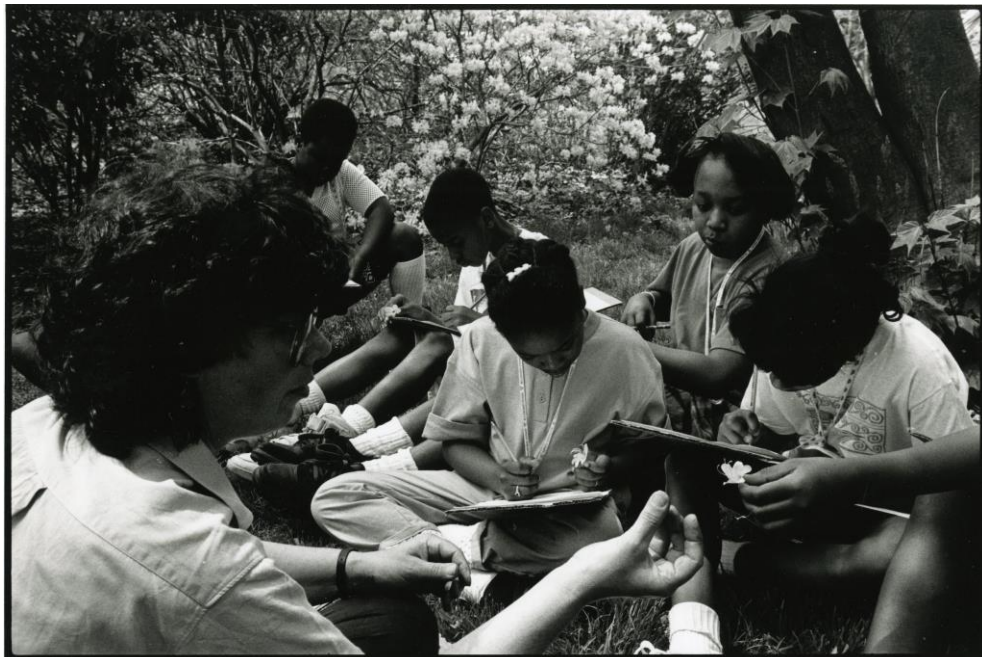
Image 1: Students from the Joseph Lee Elementary School during an FSE, May 1992.

See also: http://www.arboretum.harvard.edu/education/childrens-education-programs/field-studies-for-children/