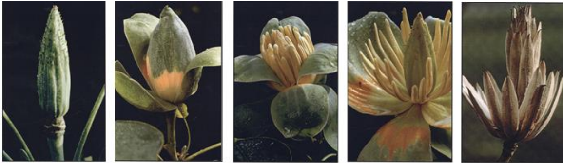
Liriodendron tulipifera (Tulip Tree)