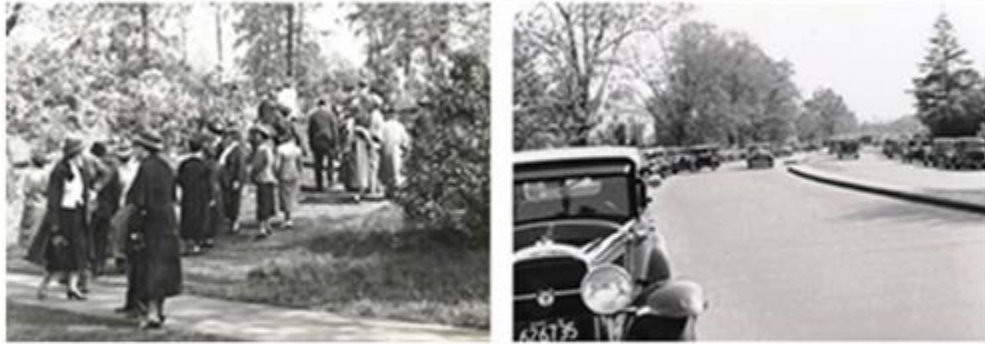
Visitors enjoying the lilacs ( on left ) and parking on Centre Street ( on right ) during Lilac Sunday, 1936