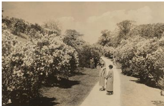
Lilacs, Spring.