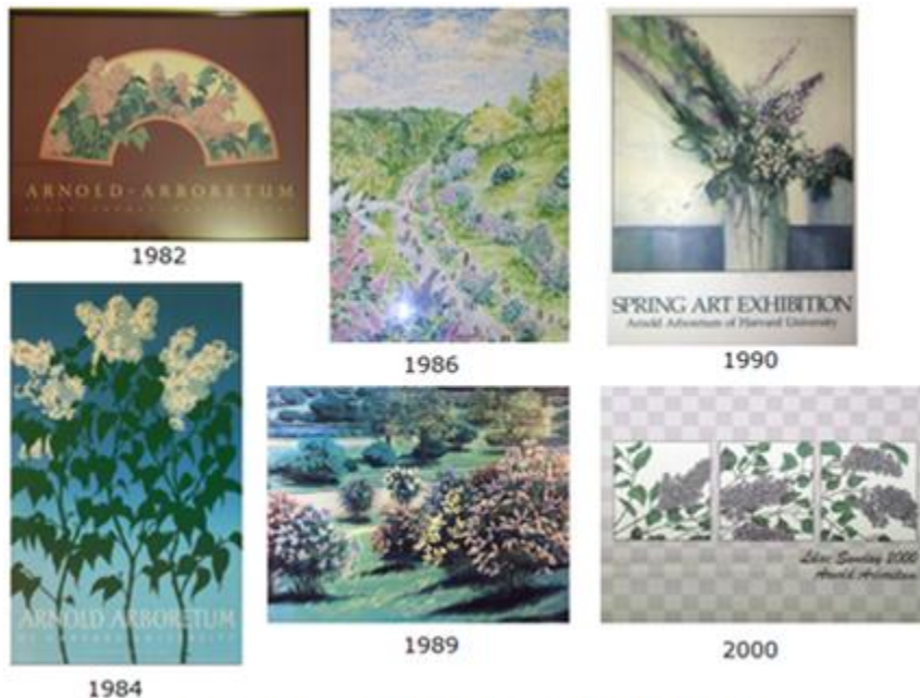
A selection of Lilac Sunday posters

Series III: Posters. Includes photographs of Lilac Sunday promotional posters and related material. For more information about the posters, see the Art and Artifact database inventory (on-site only).