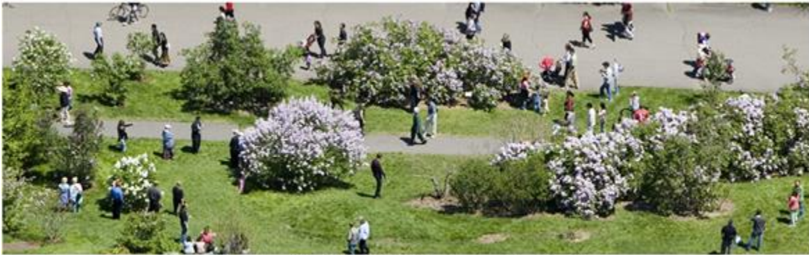
Lilac Sunday, May 13, 2007. Photograph by Jay Connor

Series II: Photographs. Most images depict visitors walking through the lilacs, on the grounds, or in front of the Hunnewell Building.