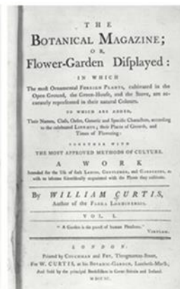
A selection of images from the collection