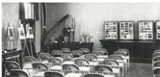
In 1955, the "lecture and demonstration" room was created on the first floor of the Hunnewell Building and the Ektachrome display panels were installed. From "Annual Report" 1955

Up until the late 1993 these illuminated wooden cases, whose lighting could be activated by the visitor, were exhibited in the Hunnewell Building either in the entrance hall or lecture hall. Upon occasion the cases were displayed at other locations outside the Arboretum in conjunction with horticultural or botanical meetings or conferences.